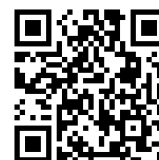
Bus Stop 9